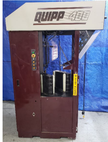
(3) Quipp 400W (1) Quipp 400N