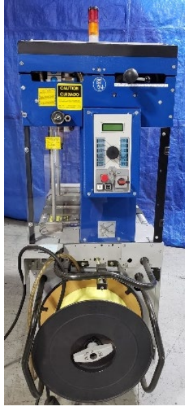
Strappers: (1) Dynaric NP5000 (6) Dynaric NP-3 (1) Dynaric NP-1500