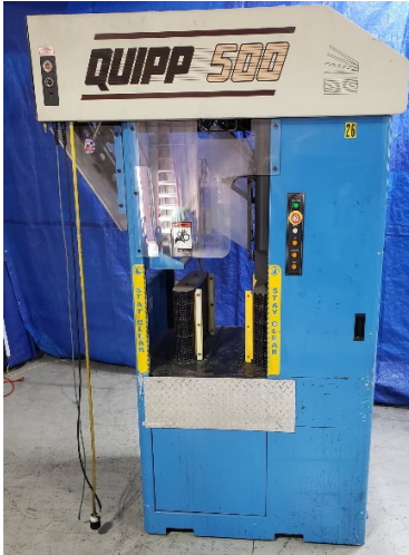
(6) Quipp 501N (2) Quipp 500N (1) Quipp 500NC (1) Quipp 501NC