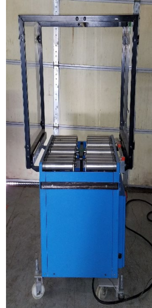
Turners: (1) Dynaric PNP-2