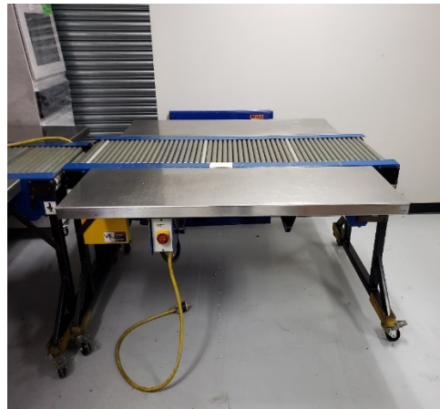
(2) 6' Long Rollertop conveyors with work apron