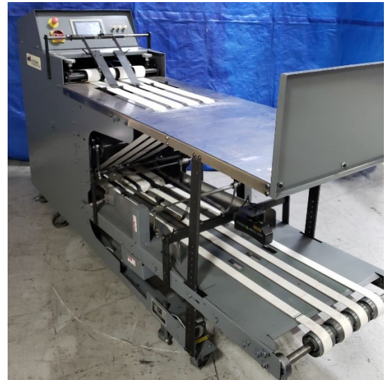
(1) Factory rebuilt STI 300(LX) Stacker