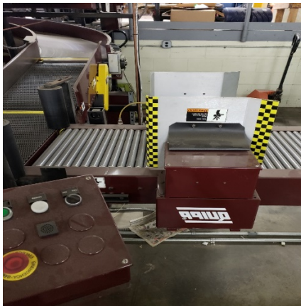
(1) 93" Quipp Roller Top conveyors with Pacer