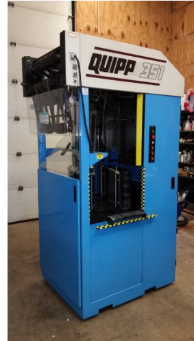
(3) Quipp 350 (1) Quipp 351