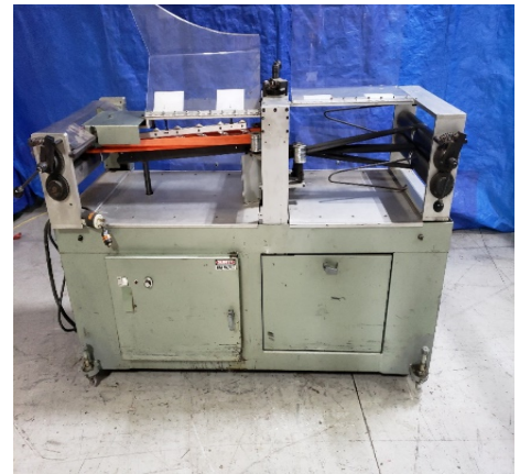
Kirk Rudy Quarter Folder