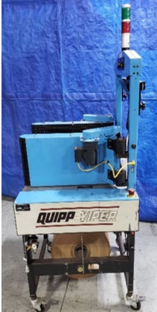
Wrappers (4) Quipp Vipers